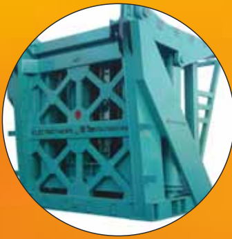
Melting equipments for Steel Plants & Foundries