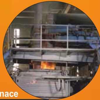
Electrotherm Refining Furnace