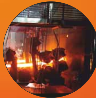
Continuous Casting Machine