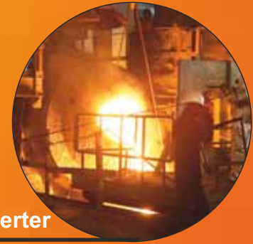
Metal Refining Konverter